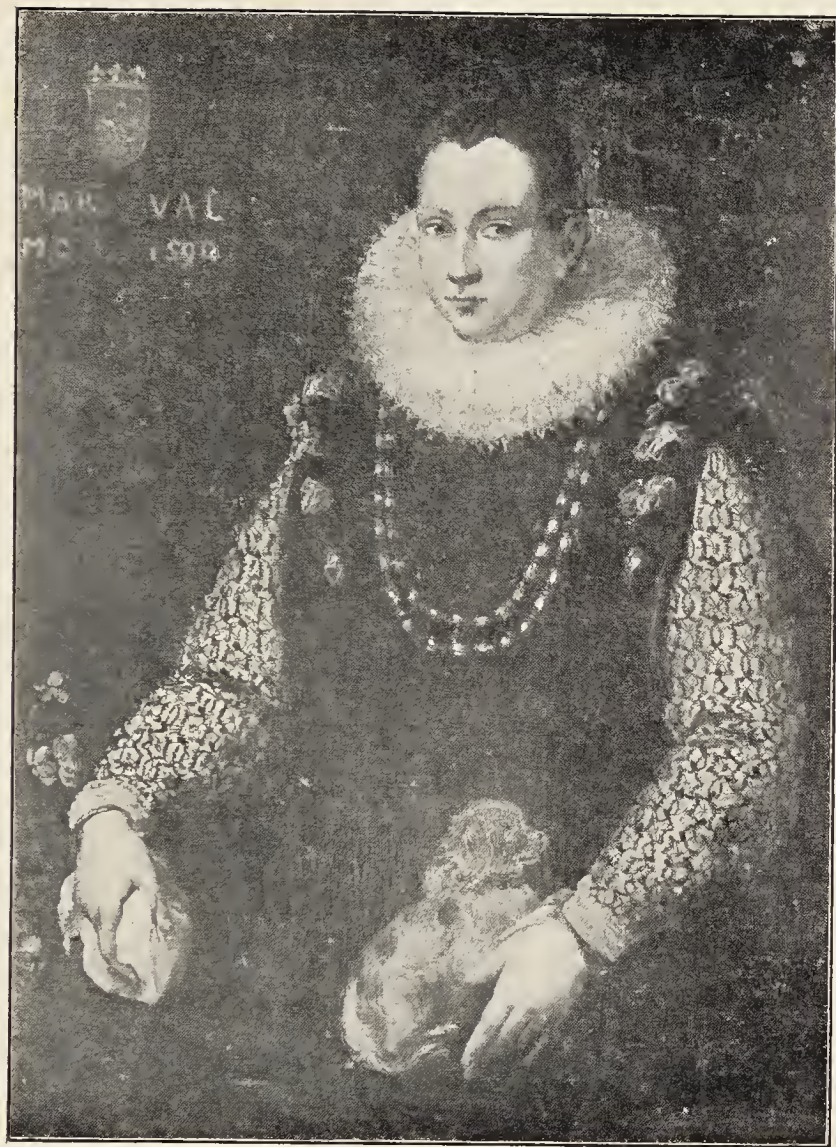
MARGARET DE VALOIS, QUEEN OF NAVARRE. Painting by François Clouet, called Janet; Chantilly.